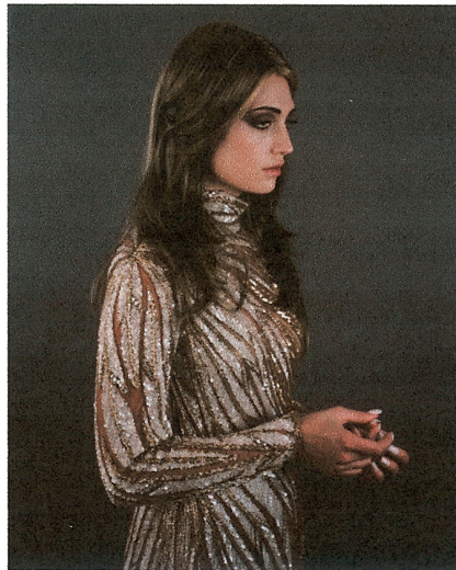
Yvonne Todd, Female Study (Gold) (detail), 2007, colour photograph. In AM I Scared, Boy (EH) : Collection works from then and now . Until 21 June at Govett-Brewster Art Gallery, New Plymouth, New Zealand. www.govettbrewster.com